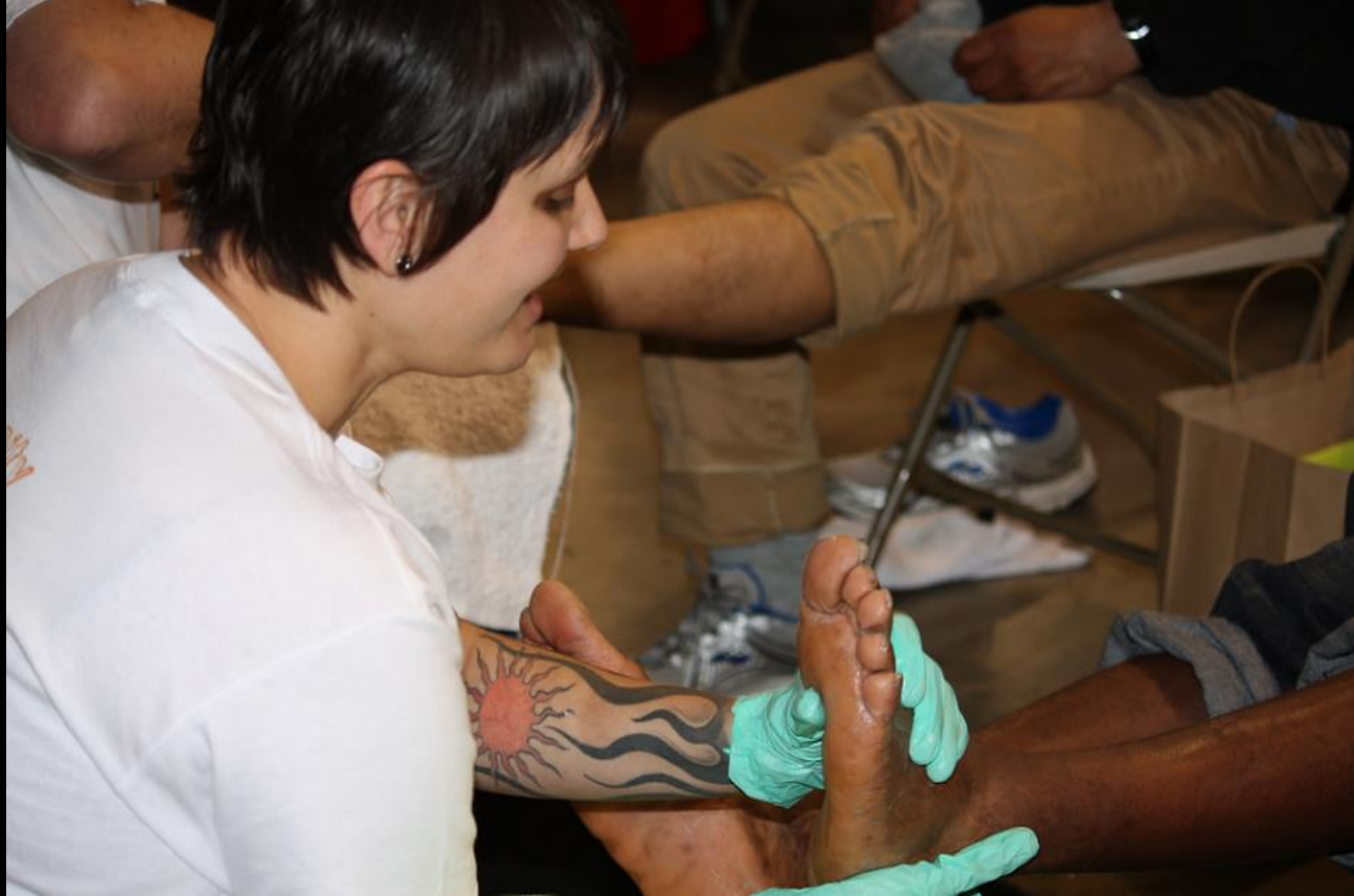
Footwashing -- Church of the Redeemer, United Way Resource Exchange, Seattle, WA