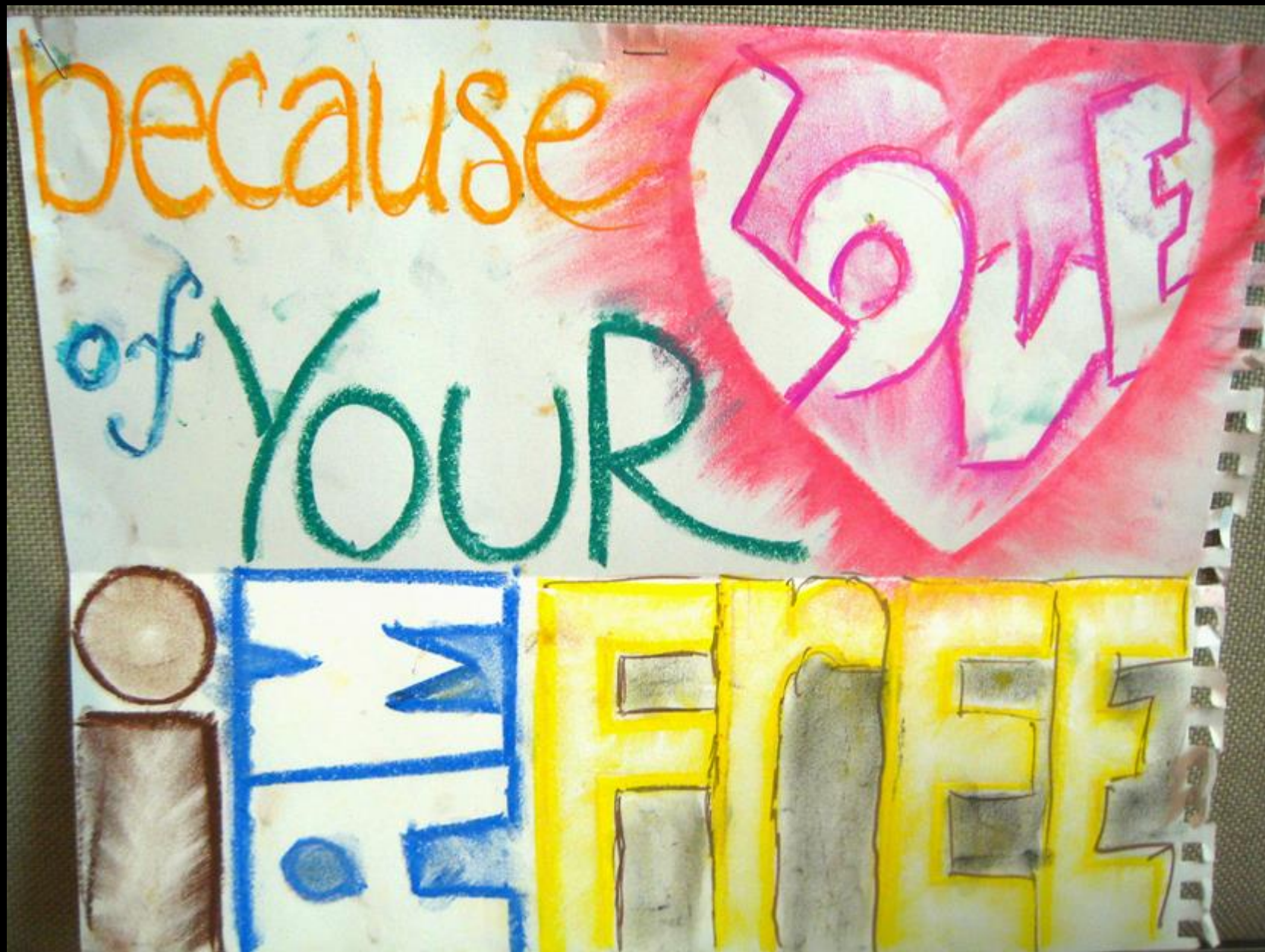
Drawing from a Christian fellowship meeting, Lingnan University, Hong Kong, China