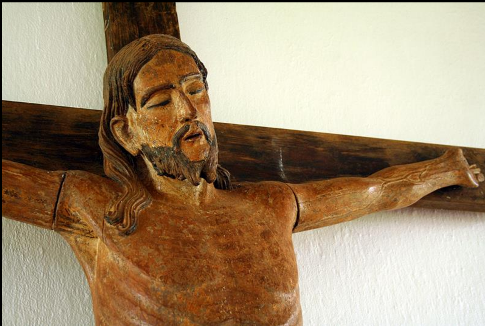
Christ on the Cross -- St. Miguel Arcanjo Church, St. Miguel, Brazil