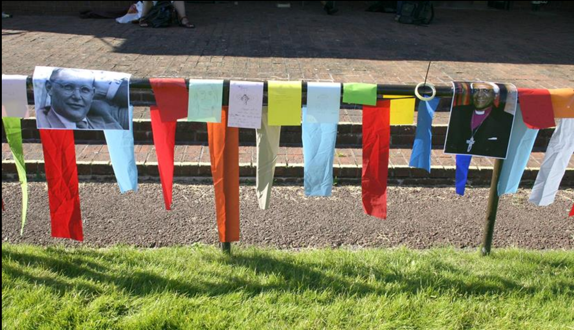
"Placing yourself in god's story, among the heroes of the faith on the arena rail..." From an alternative worship service held at an emerging church festival in Cheltenham, UK