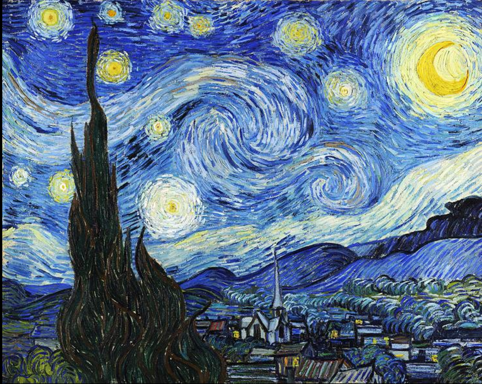
Starry Night -- Vincent van Gogh, Museum of Modern Art, New York, NY