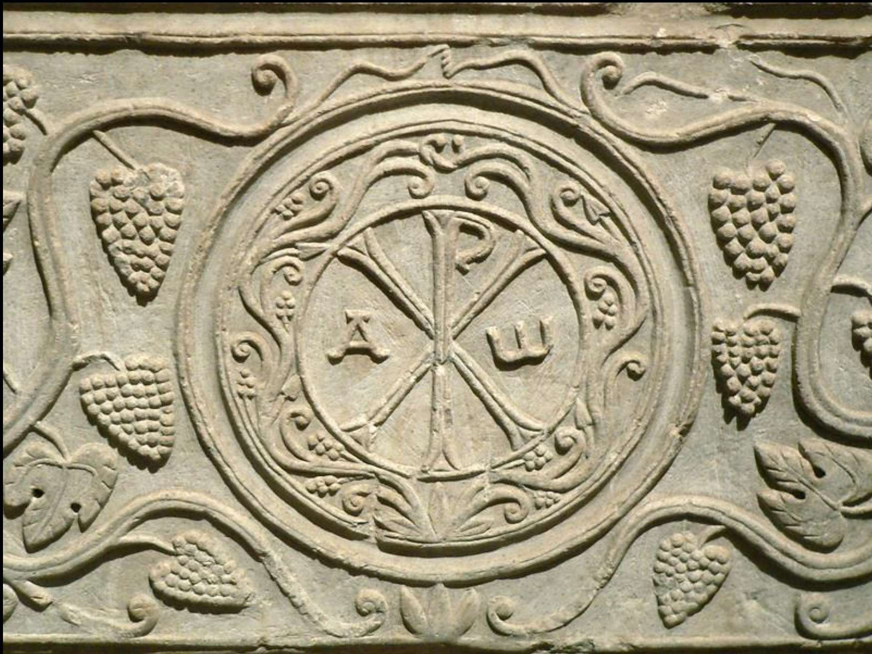
Alpha and Omega -- Drausin Sarcophagus, Louvre Museum, Paris, France