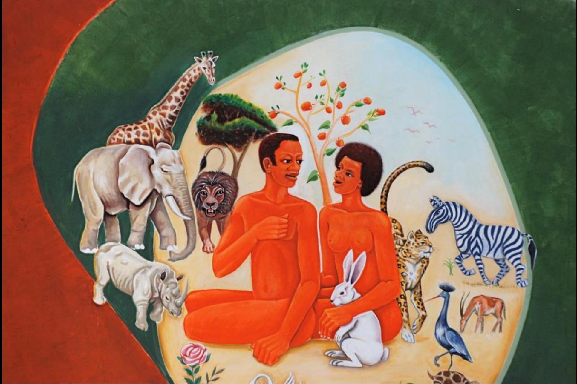
St. Mathias Mulumba Kalemba Metropolitan Cathedral, Songea, Tanzania