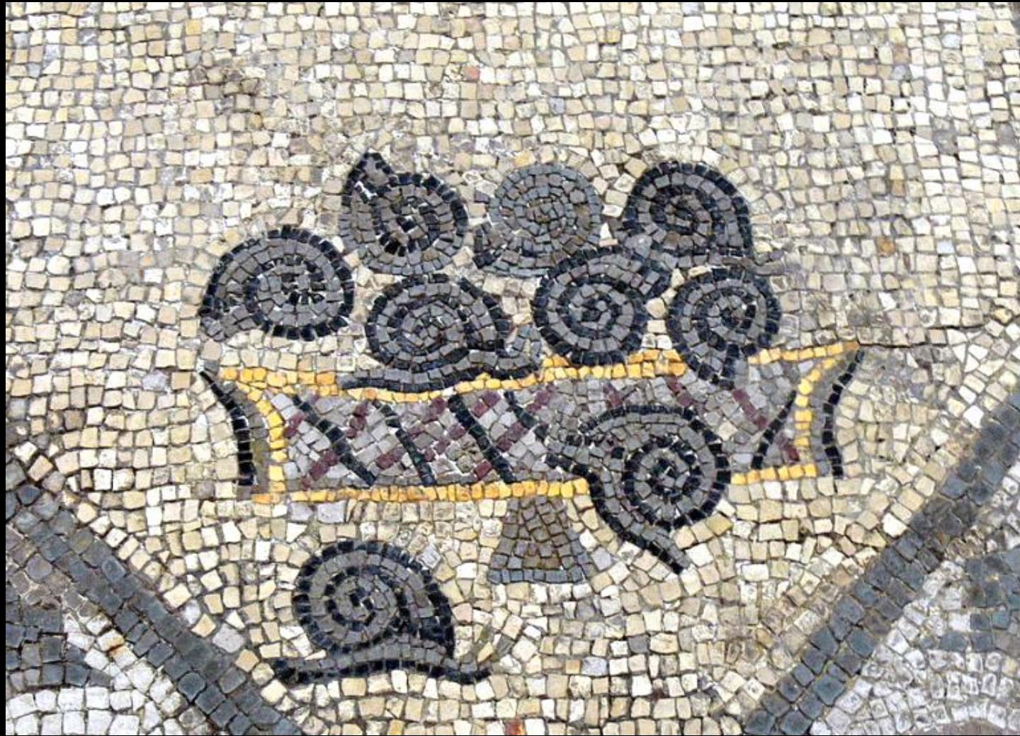
Snails -- Floor mosaic, Basilica of Aquileia, Aquileia, Udine, Italy