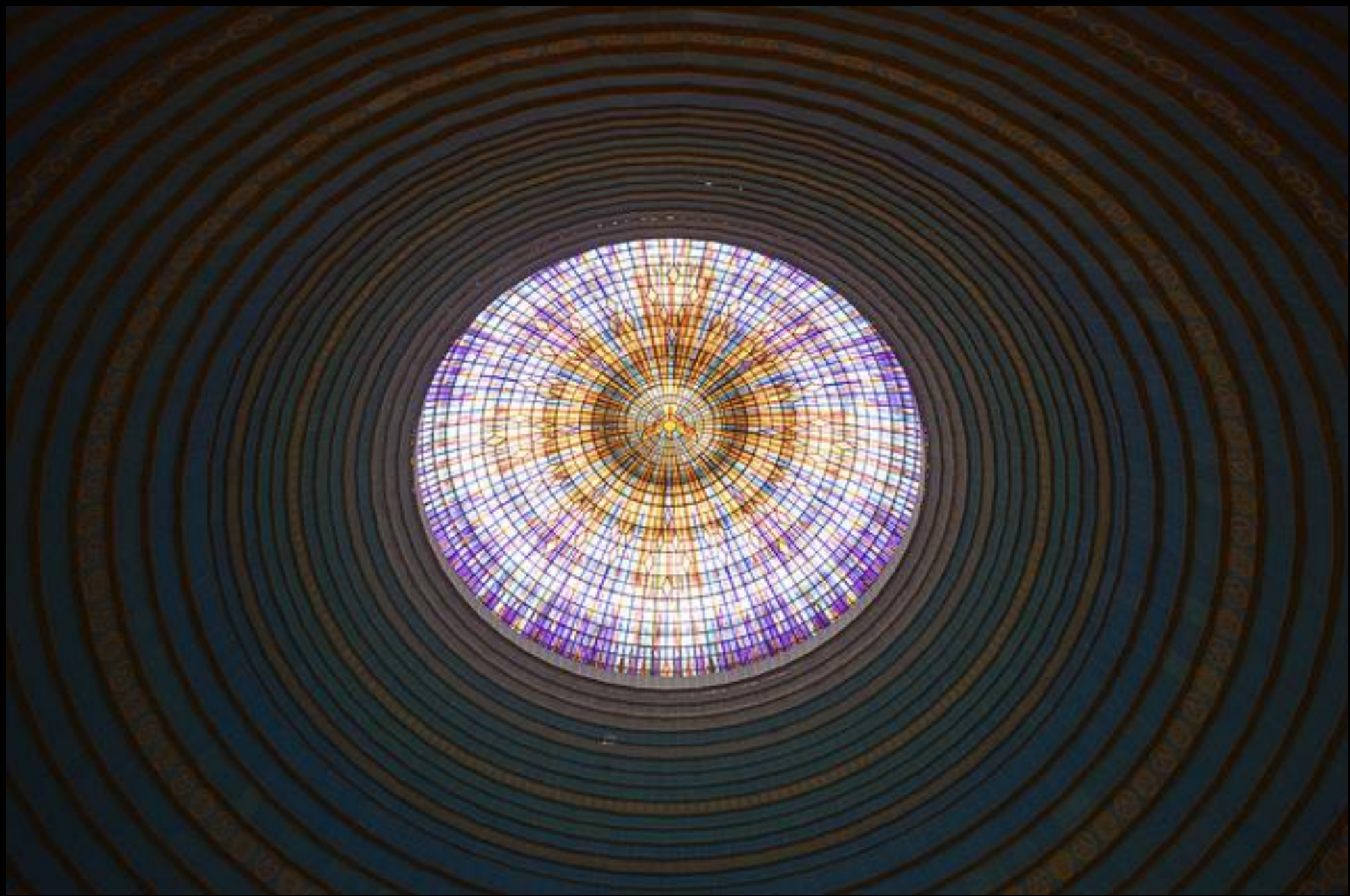
Basilica of Our Lady of Peace -- Yamoussoukro, Ivory Coast