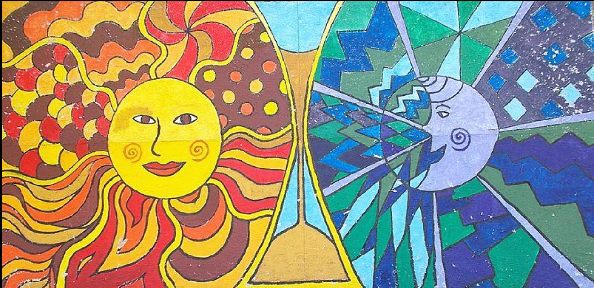
Sun and Moon -- Nagy Community Center, Budapest, Hungary