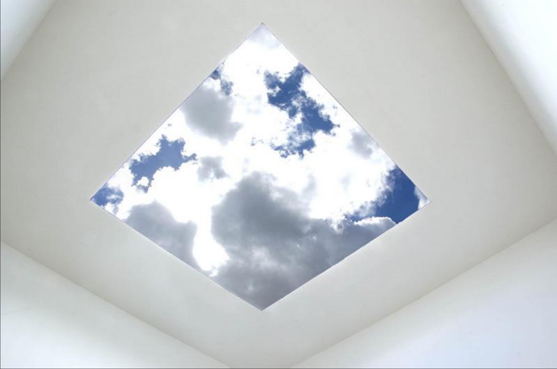
Skyspace -- James Turrell, Live Oak Meeting House, Society of Friends, Houston, TX