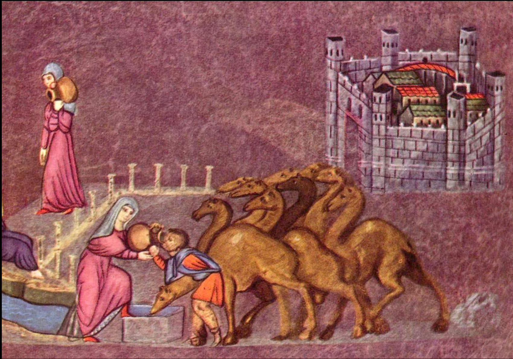
Rebecca at the Well -- Österreichische Nationalbibliothek, Vienna, Austria