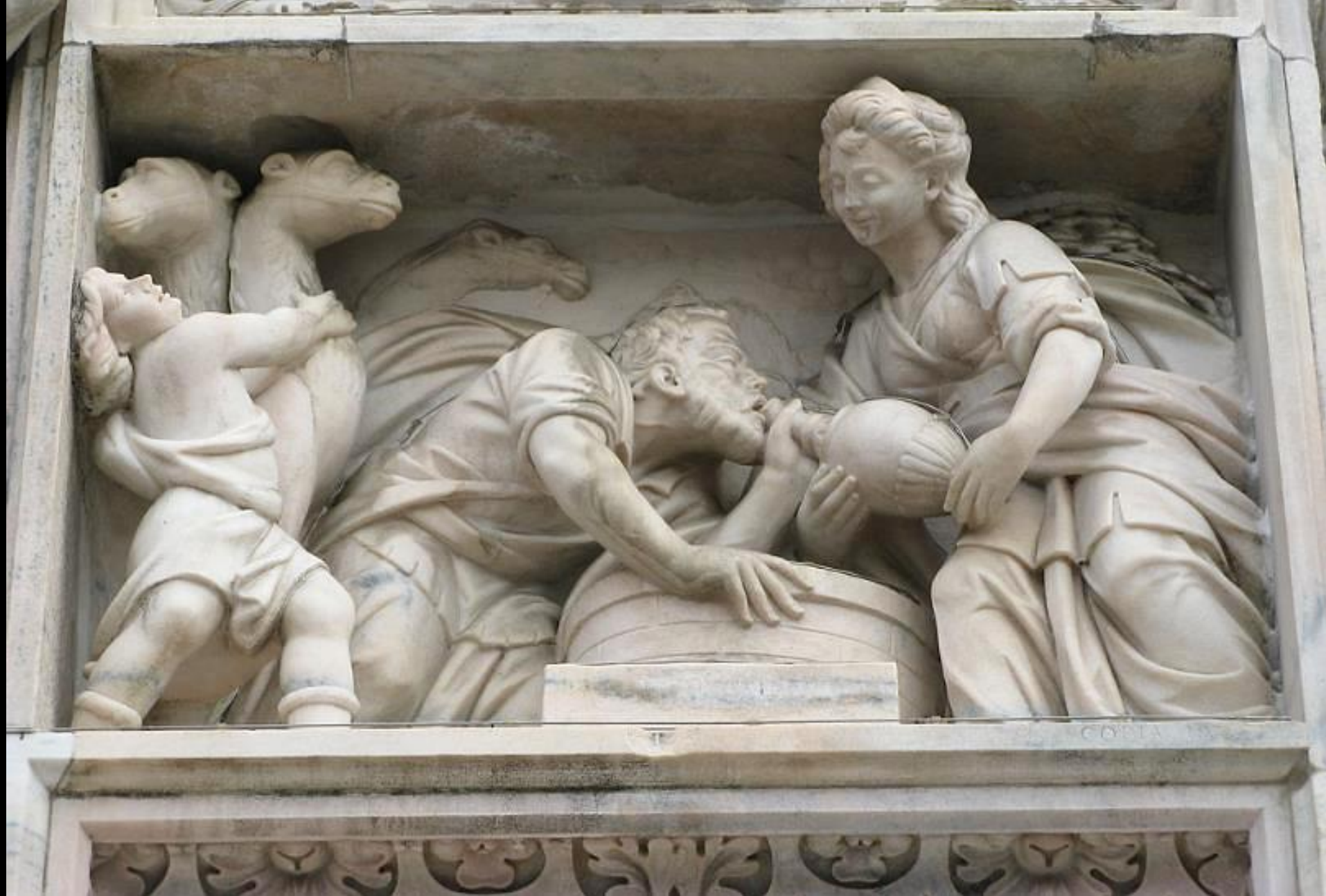
Isaac's Messenger Drinks from Rebecca's Jug -- Duomo, Milan, Italy