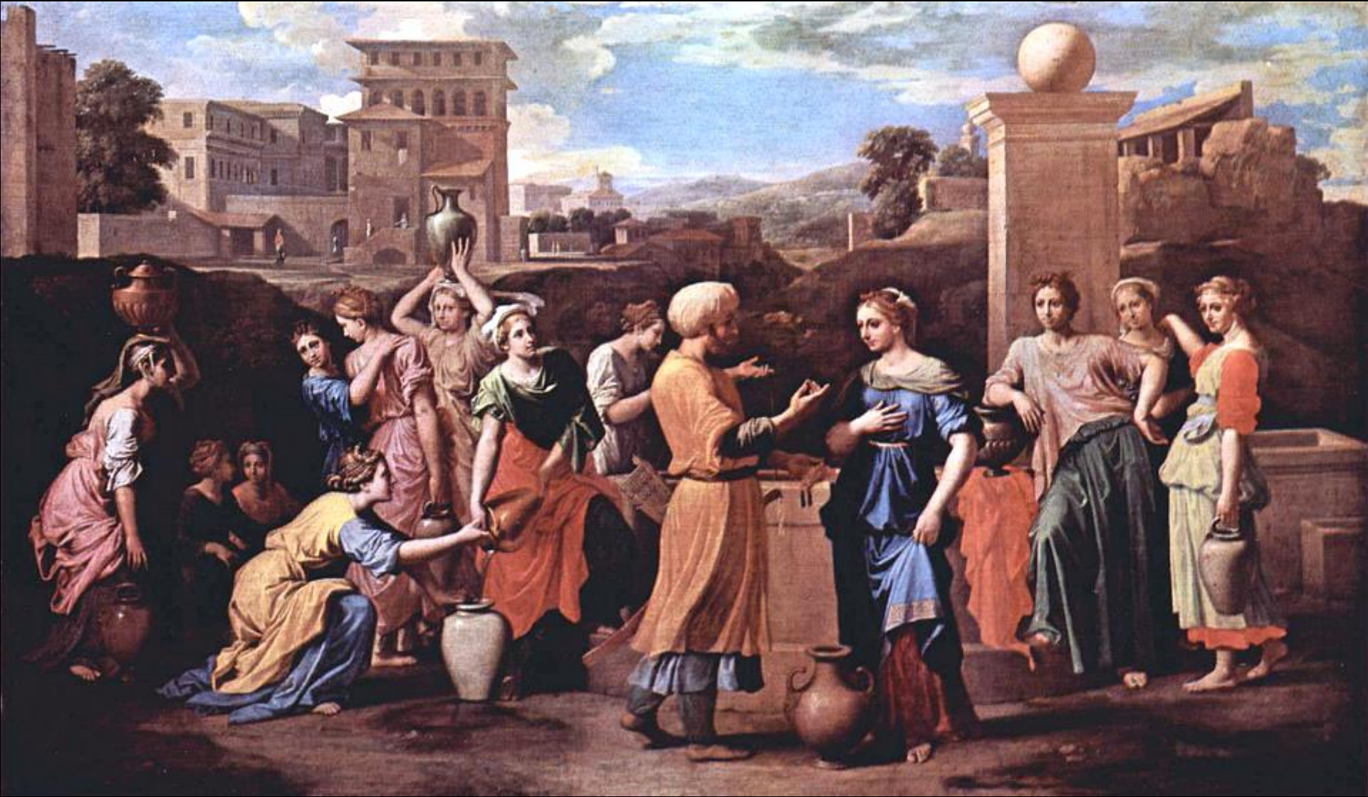
Rebecca at the Well -- Nicolas Poussin, Louvre Museum, Paris, France