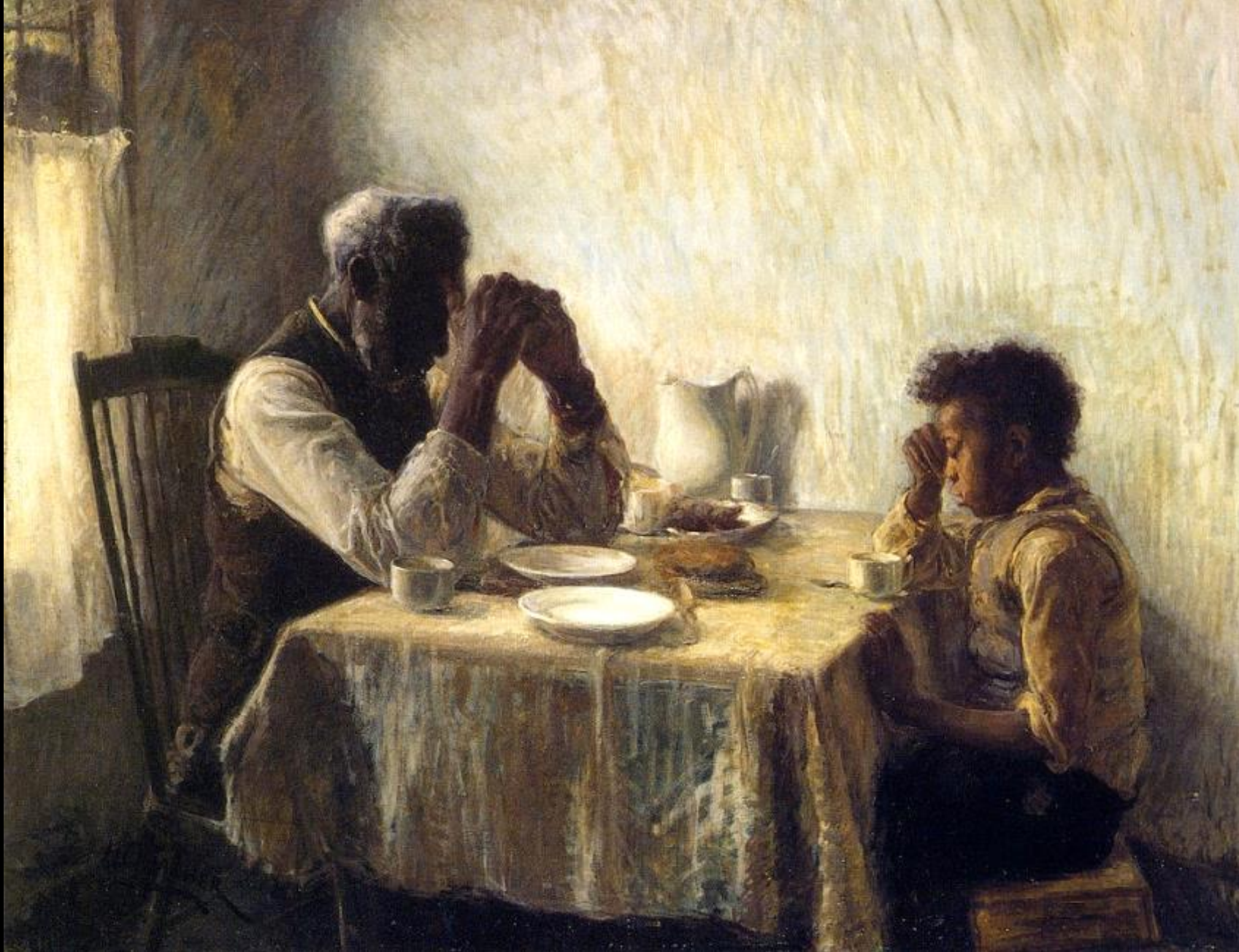
The Thankful Poor -- Henry Ossawa Tanner