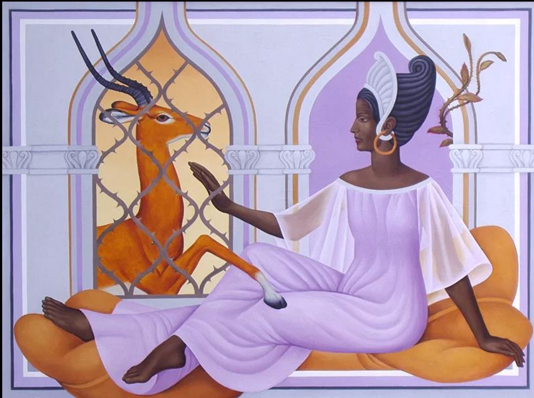
Lattice Window – Song of Solomon -- Peter Koenig