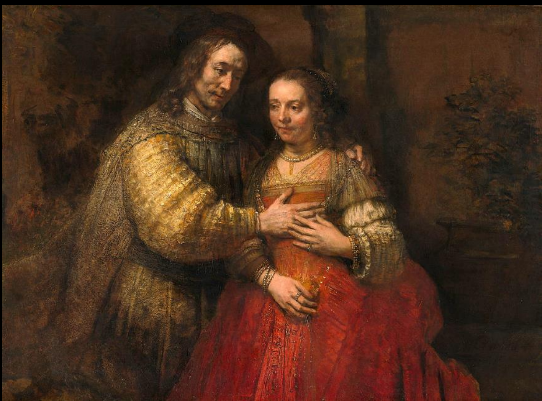
Isaac and Rebecca -- Rembrandt, Rijksmuseum, Amsterdam, Netherlands