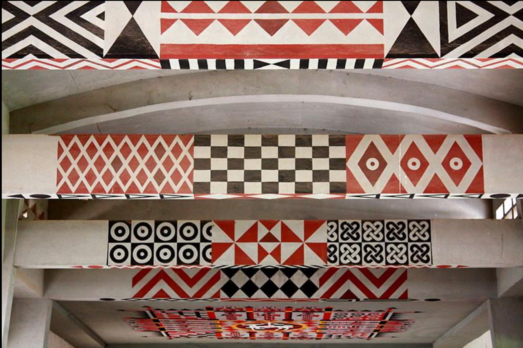
Ceiling of Keur Moussa Abbey, Senegal