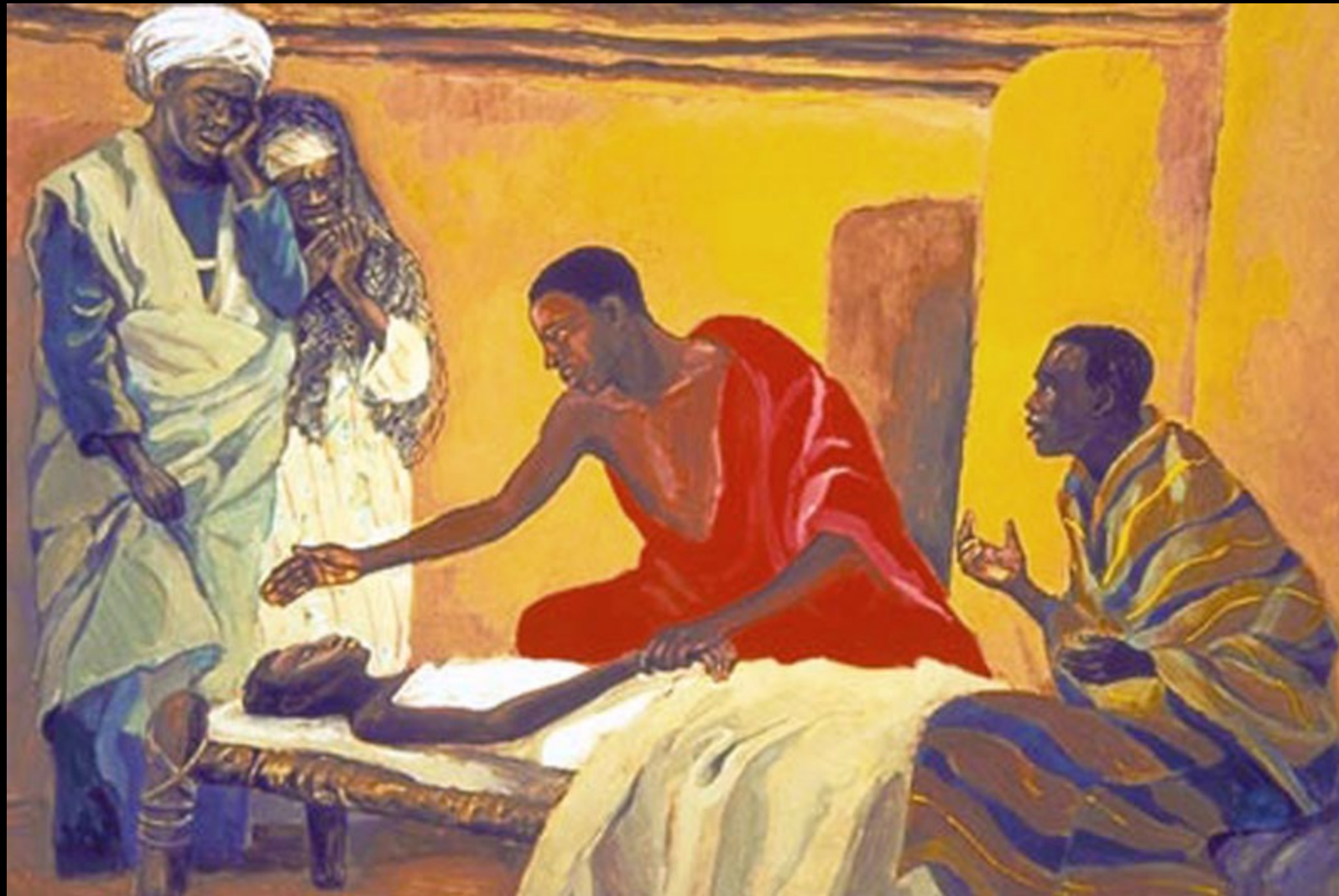
Jesus Raises the Child -- JESUS MAFA, Cameroon