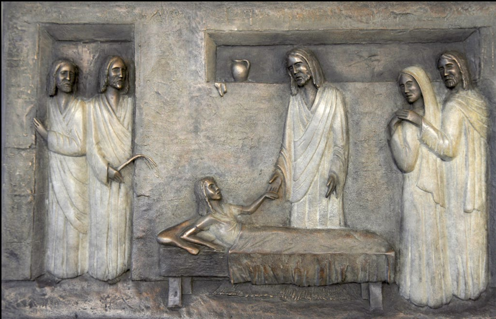
Jesus Raises the Daughter to Life -- National Children's Hospital, Tallaght, Dublin, Ireland