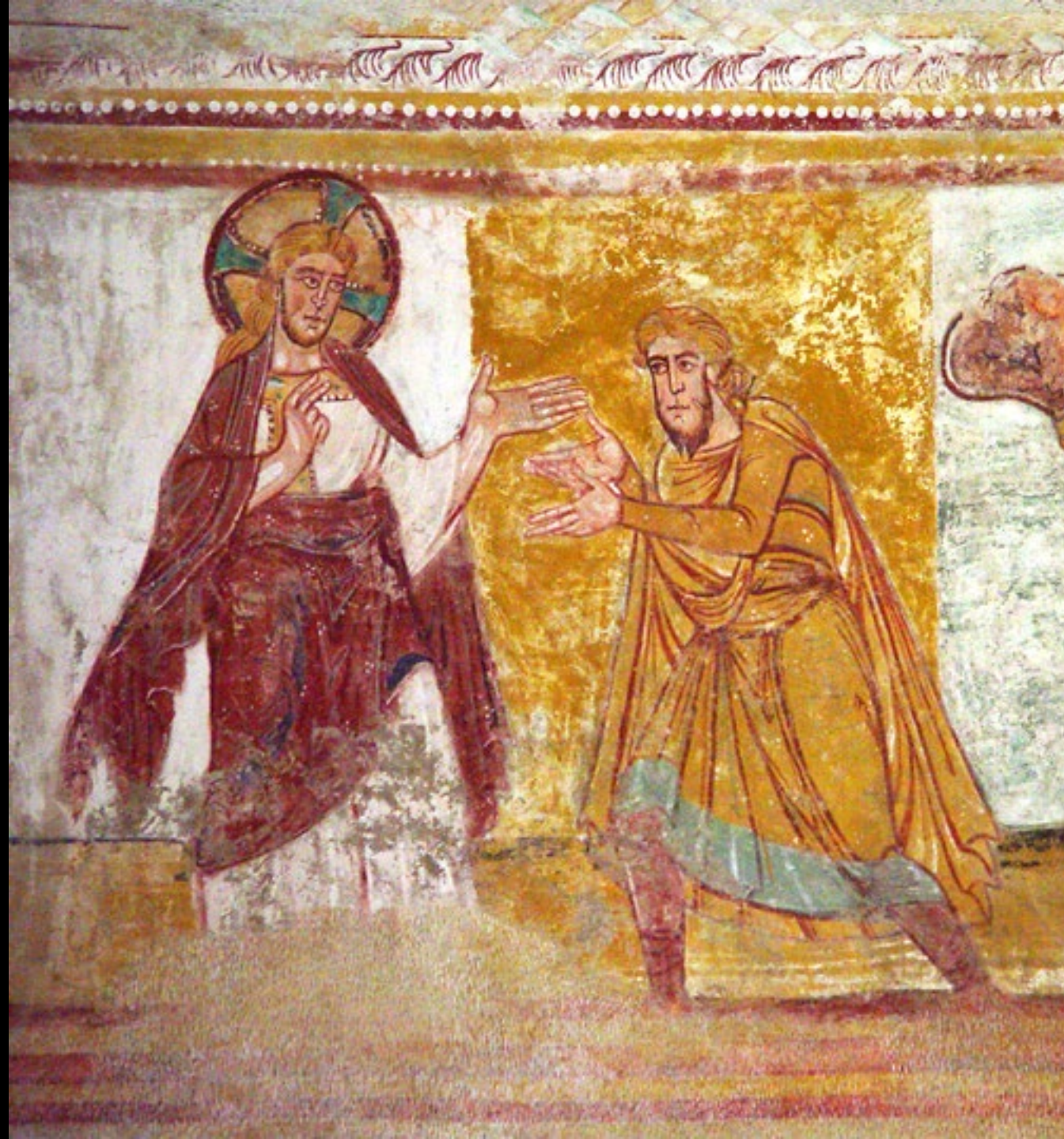
The Calling of Abraham