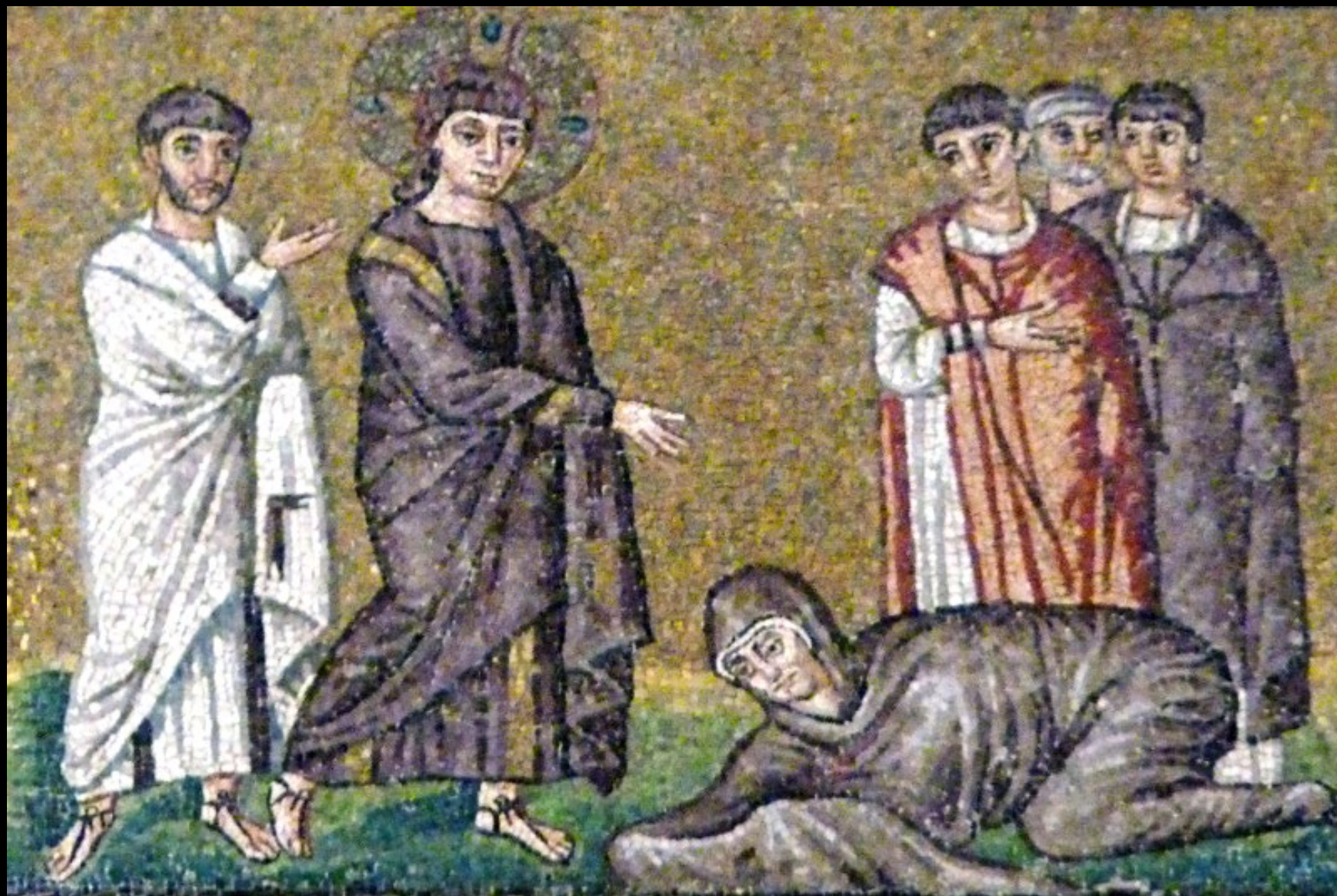
Christ Heals the Woman Who Touched His Cloak -- Sant'Apollinaire Nuovo, Ravenna, Italy