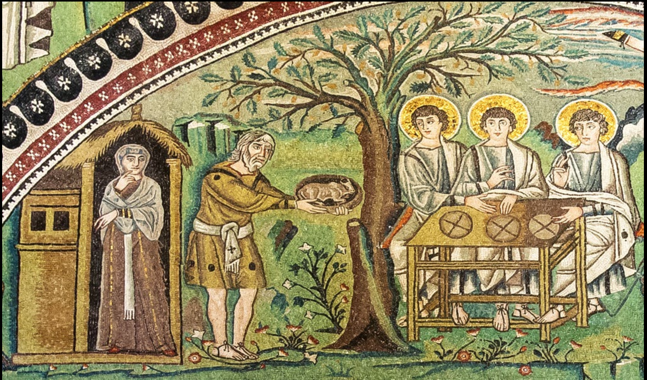
Sarah and Abraham Offer Hospitality to God's Messengers -- San Vitale, Ravenna, Italy