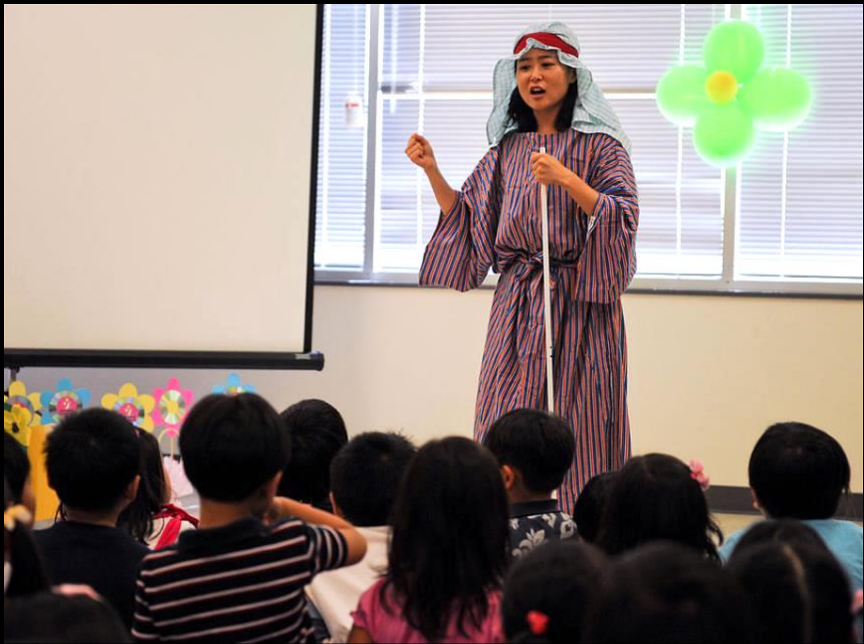
Sunday School -- Korean Central Presbyterian Church, Centreville, VA