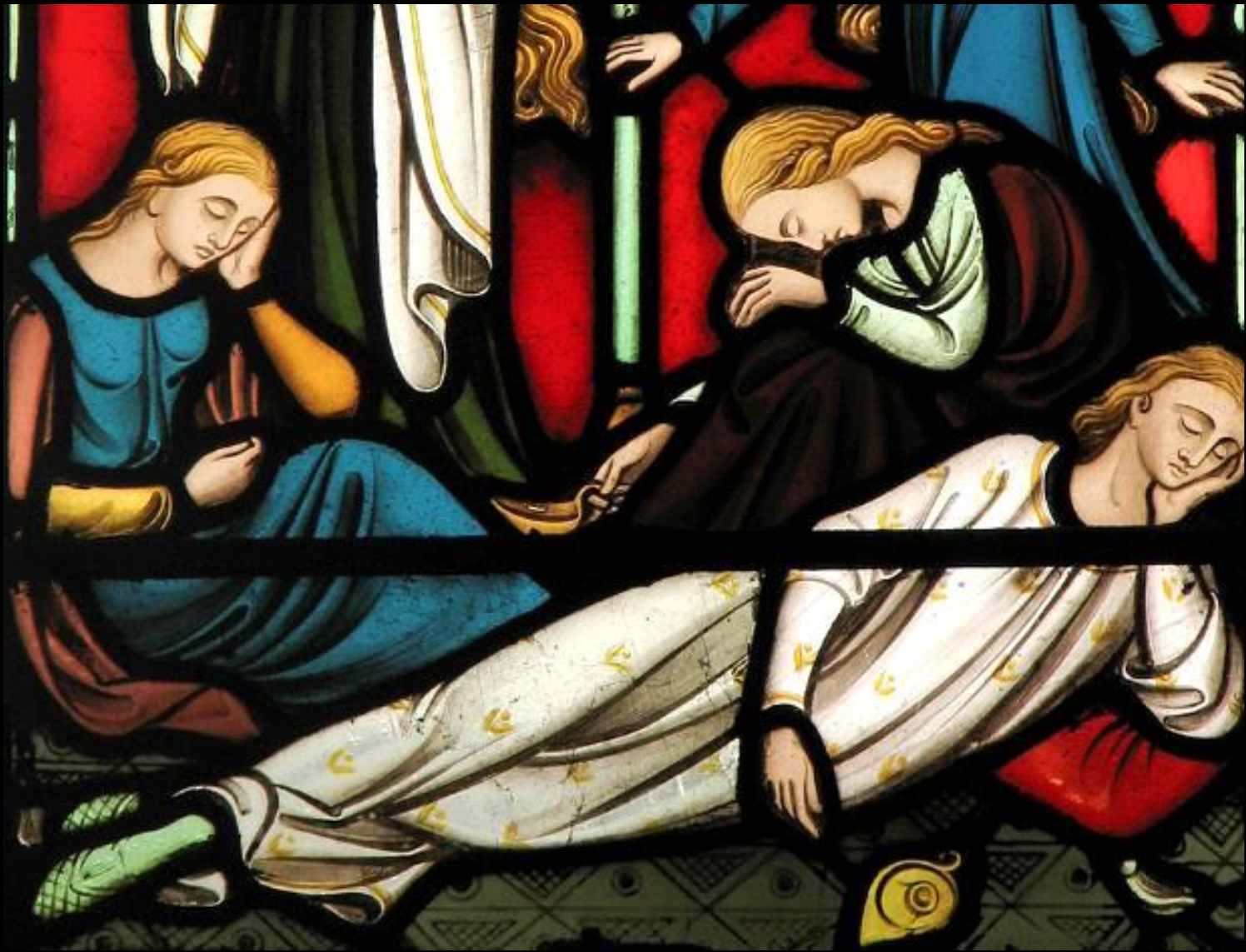
The Bridesmaids Sleeping -- Stained Glass, Church of St. Giles, Oxford, England