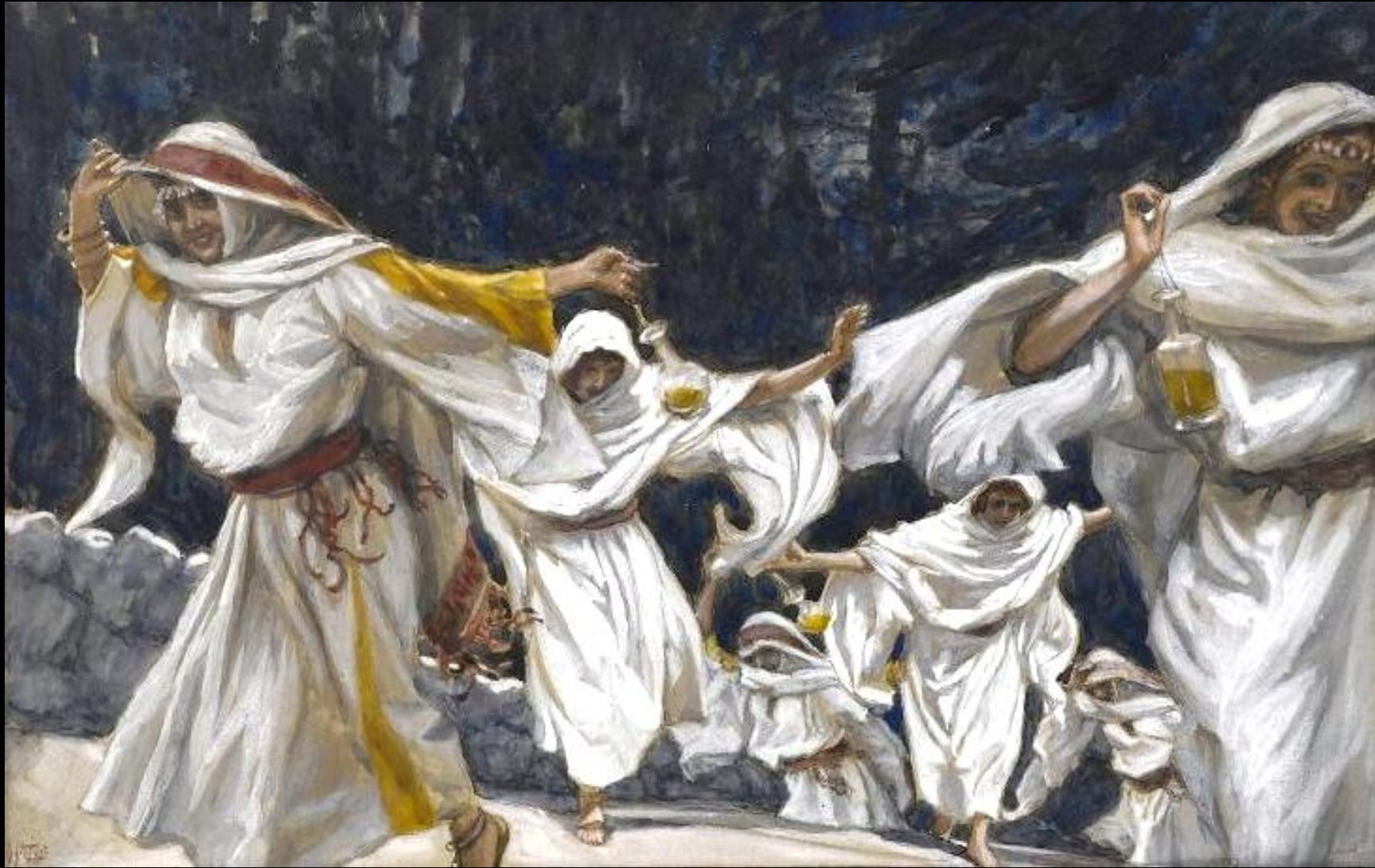
The Bridesmaids -- James Tissot, Brooklyn Museum, New York, NY