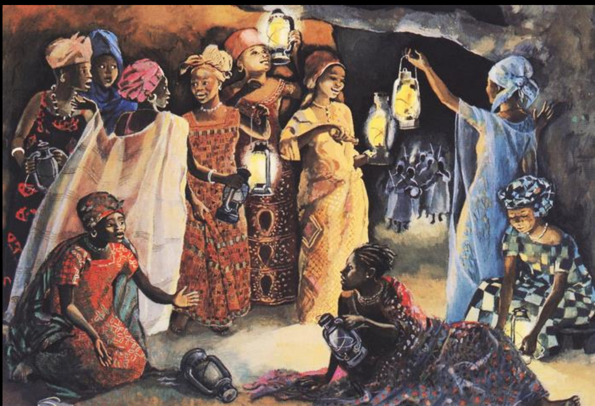
The Ten Bridesmaids -- JESUS MAFA, Cameroon