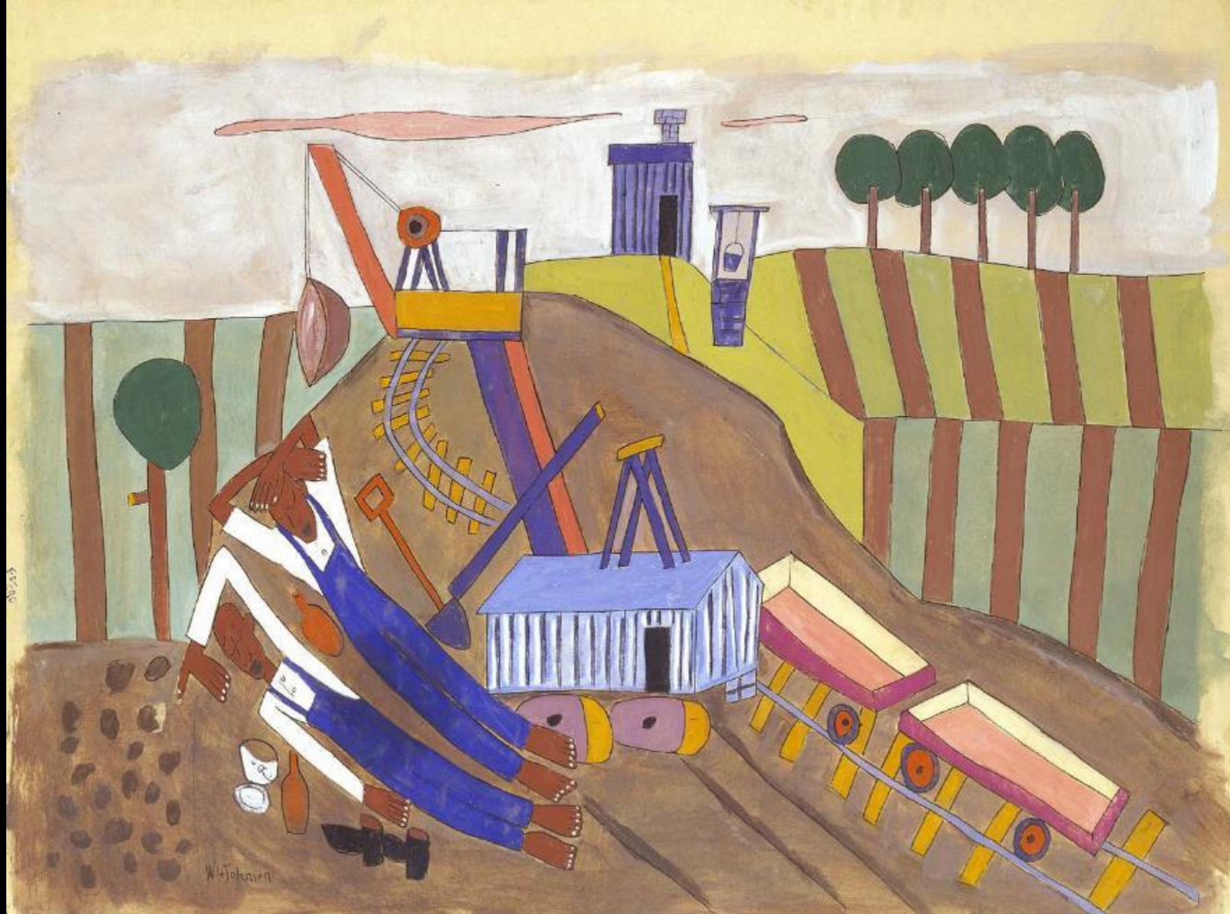
Lunchtime Rest -- William H. Johnson, Smithsonian Museum of American Art, Washington, DC