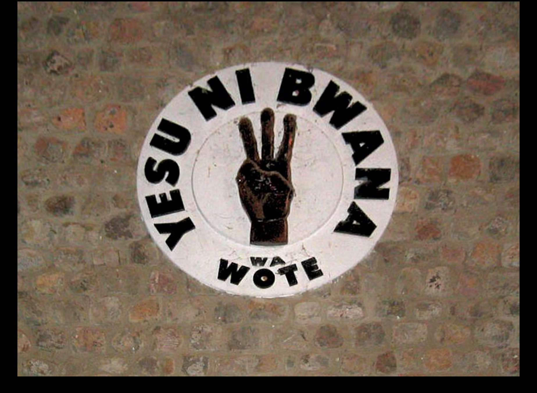
JESUS IS LORD! -- From a United Methodist Church in Congo (DRC)