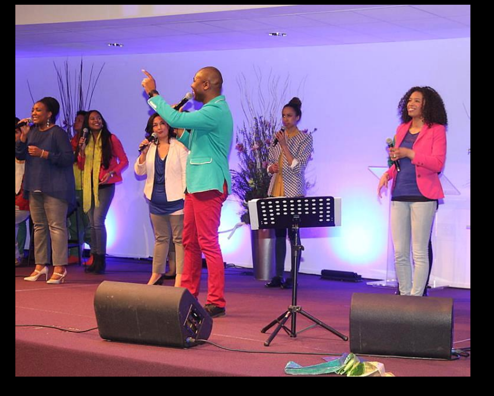
Singers and Choir -- Pentecostal Church of the Living Stone, Spijkenisse, Netherlands