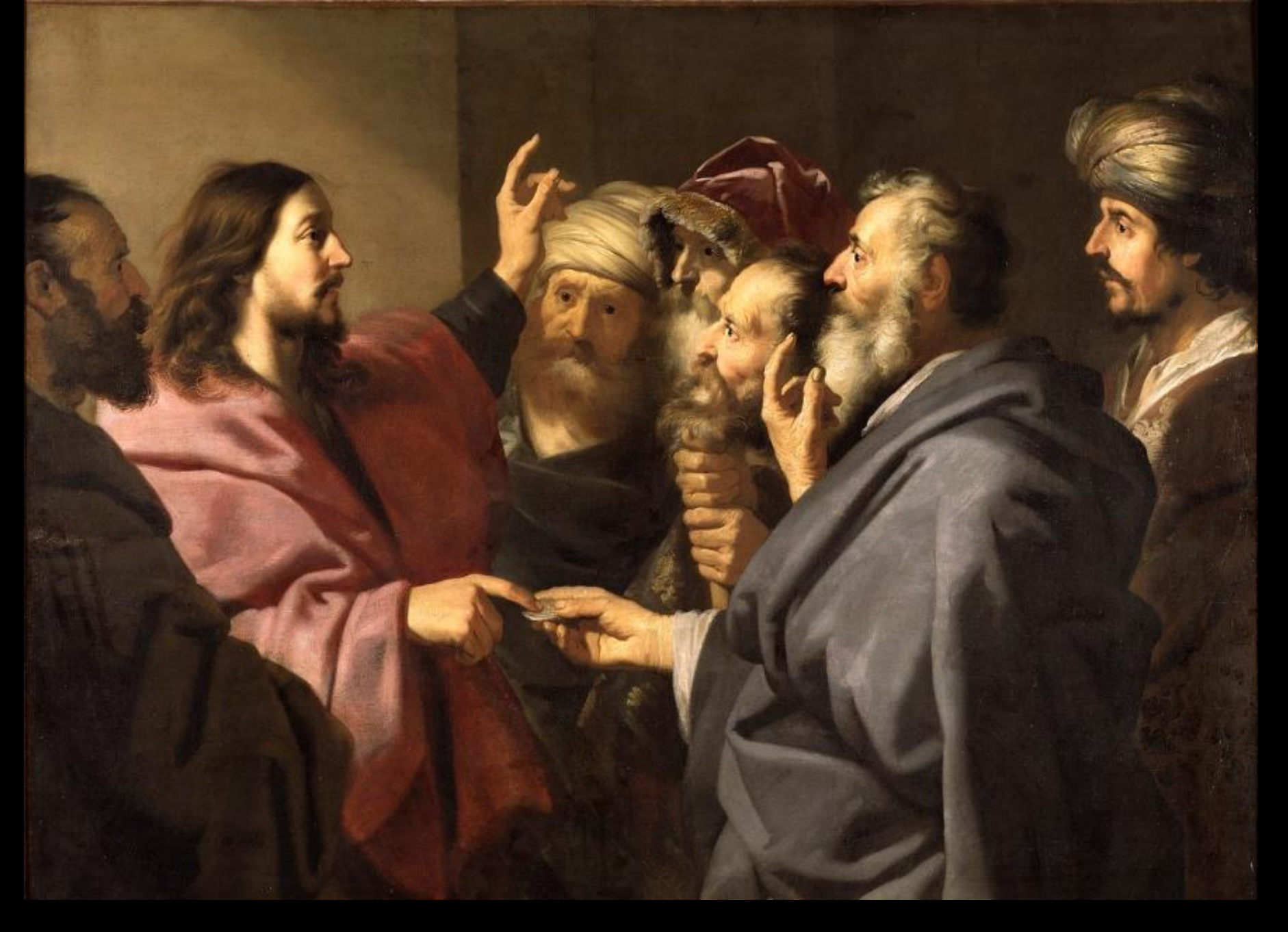
The Tribute Money -- Jacob Backer, National Museum, Stockholm, Sweden