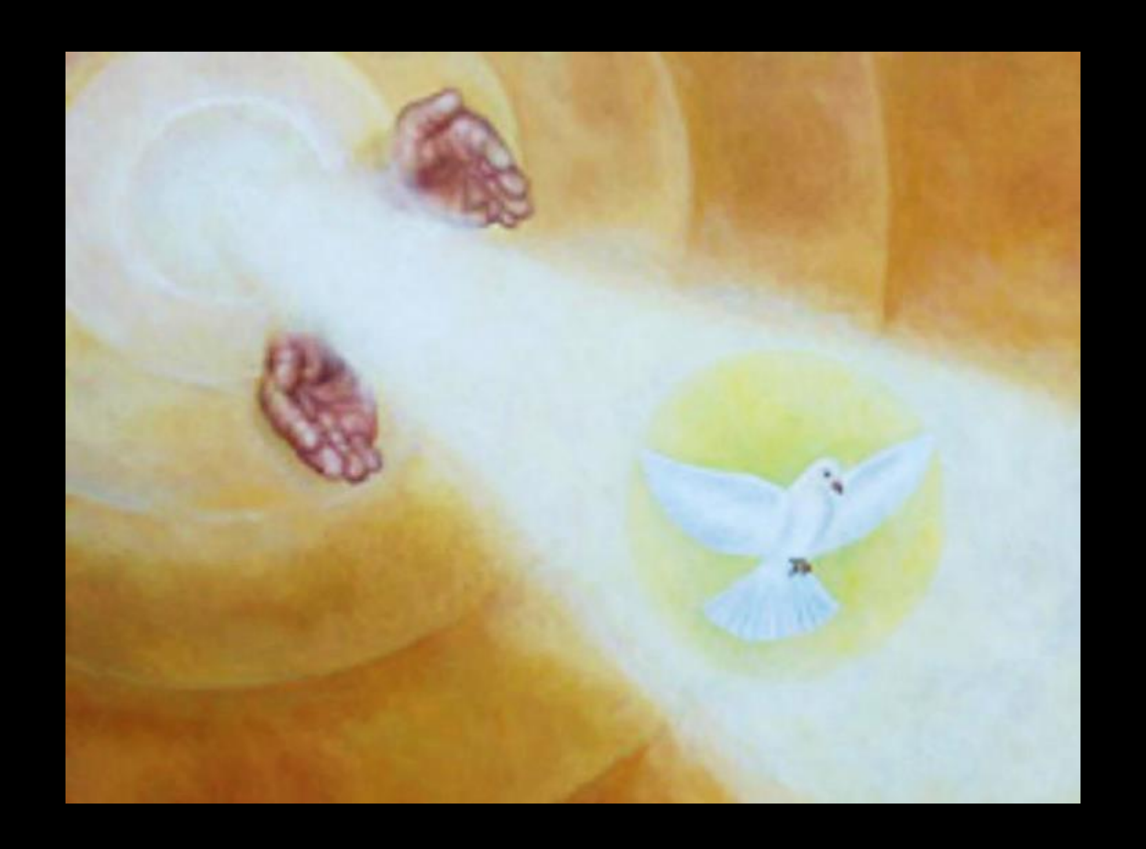
Church of the Holy Trinity, Caacupe, Paraguay