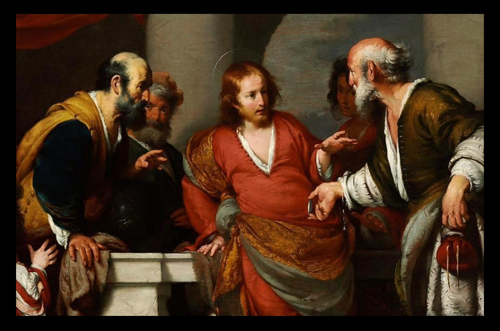
The Tribute Money -- Bernardo Strozzi, Museum of Fine Arts, Budapest, Hungary