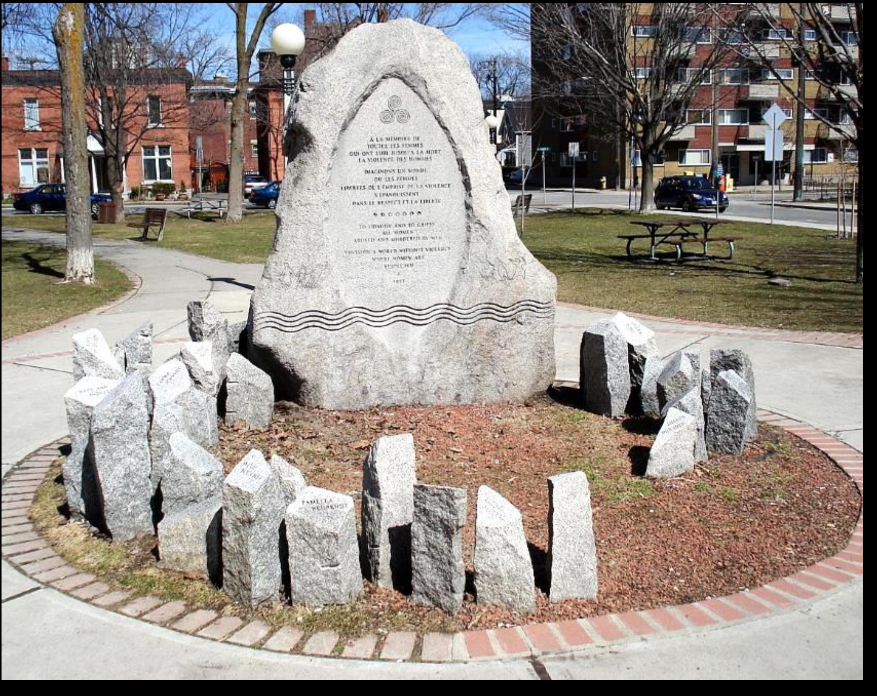
Enclave: Monument to Victims of Domestic Violence -- Ottawa, Canada