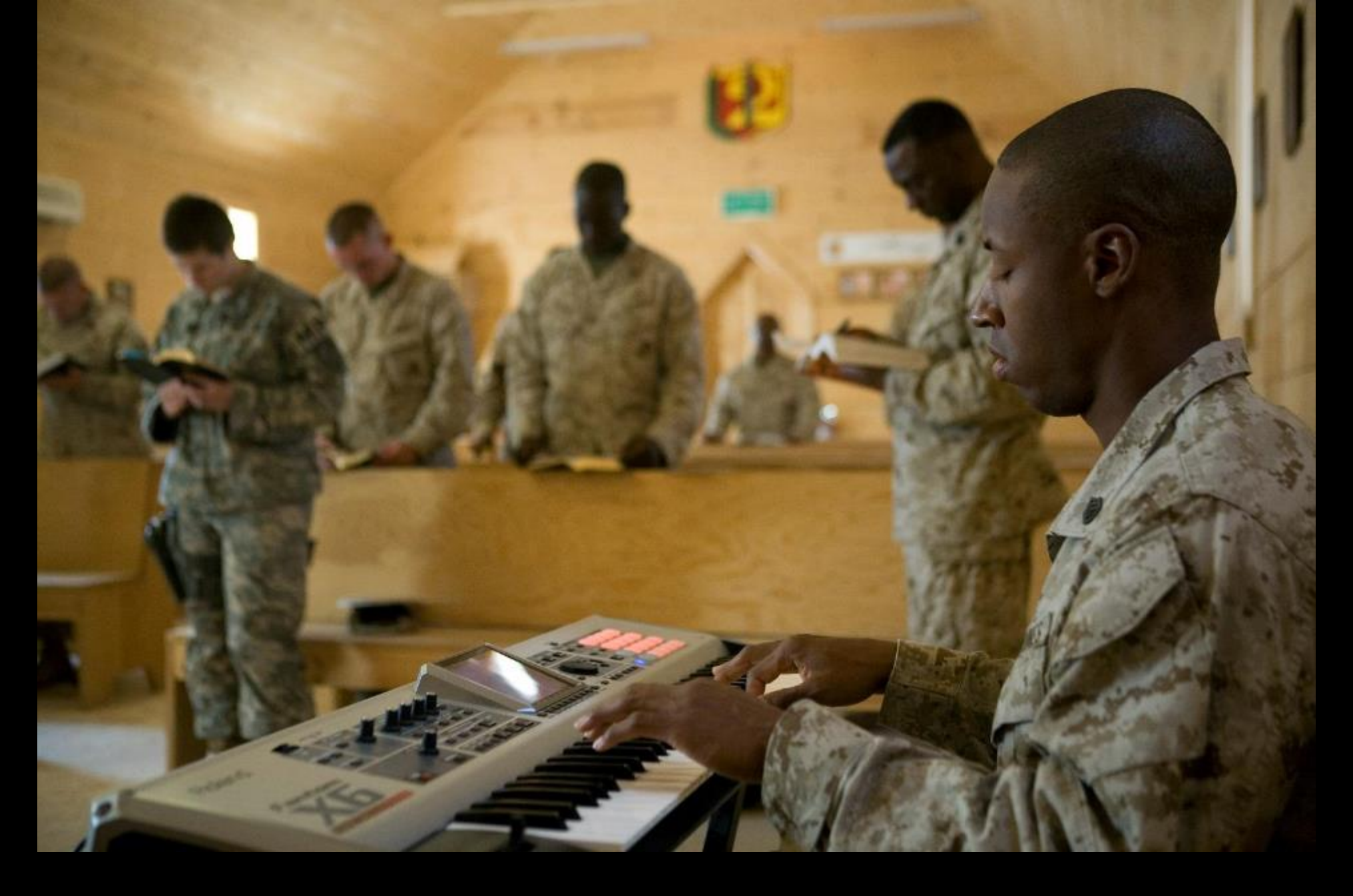
Marine Regimental Combat Team Worship Service, Camp Ripper Chapel, Al Asad, Iraq