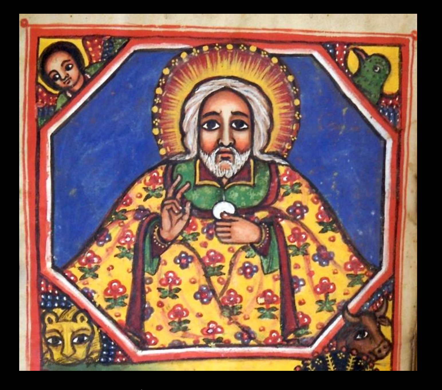
Face of God -- Ethiopian 18<sup>th</sup> c. manuscript, Church of Narga Selassie, Lake Tana, Ethiopia