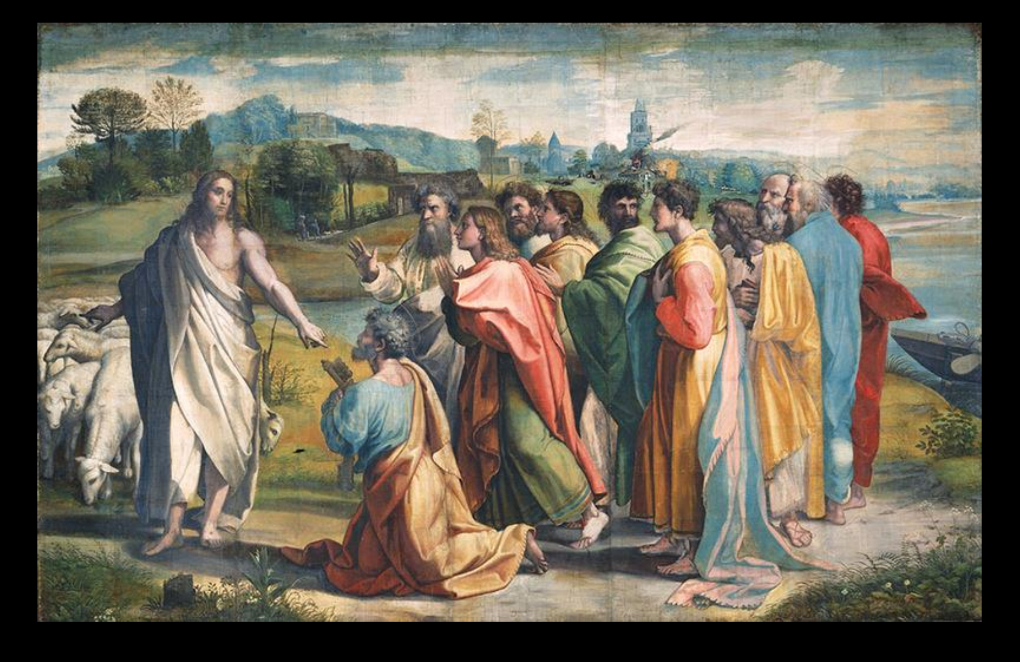
Peter Proclaims the Christ -- Raphael, Victoria and Albert Museum, London, England