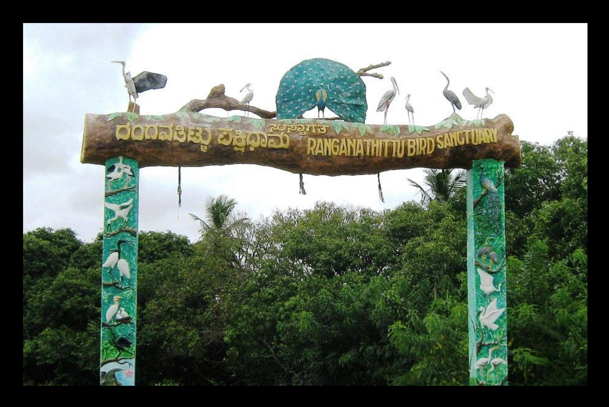
Ranganthittu Bird Sanctuary, Mysore, India