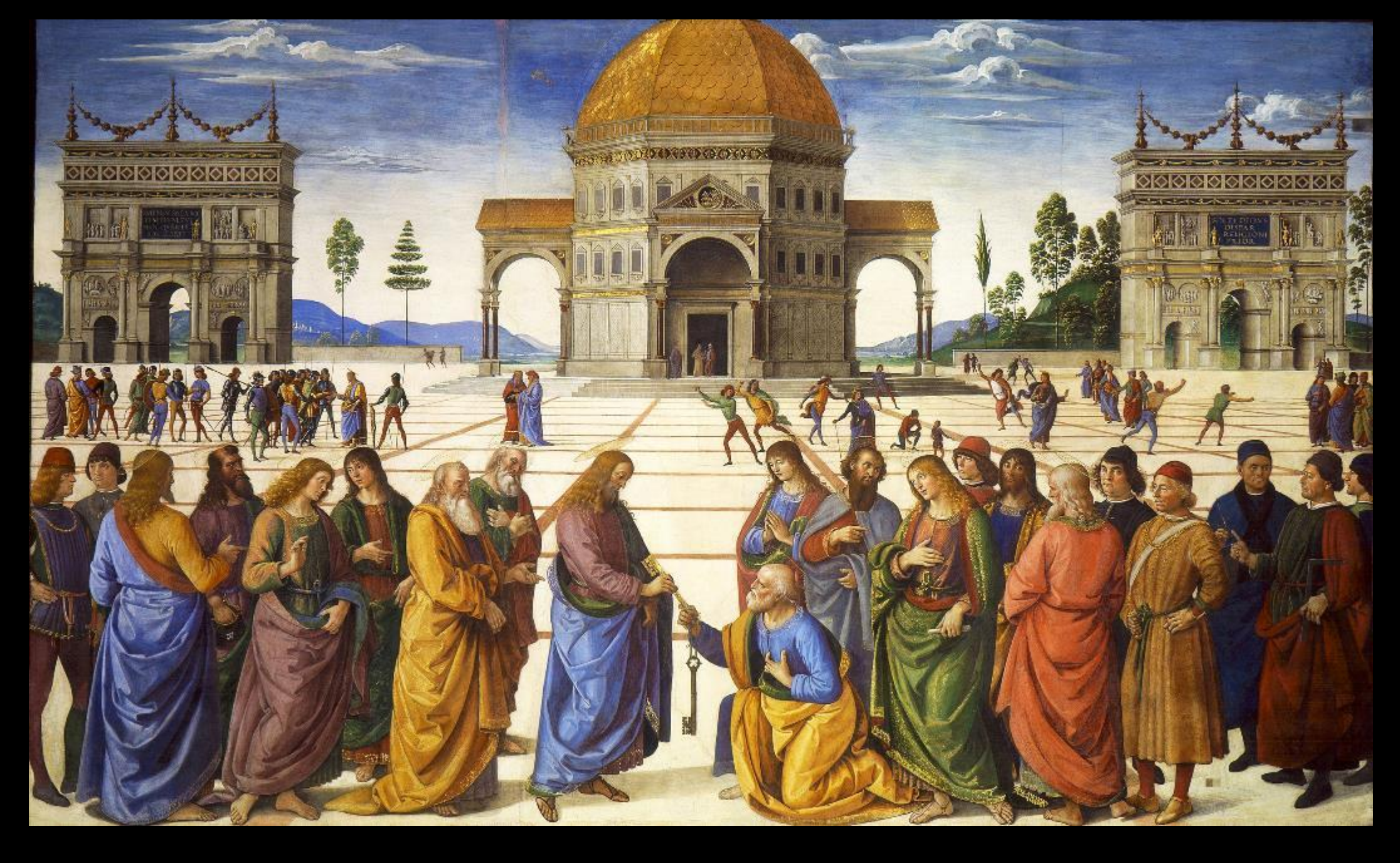
Christ Gives Keys of Kingdom to Peter -- Perugino, Sistine Chapel, Vatican City