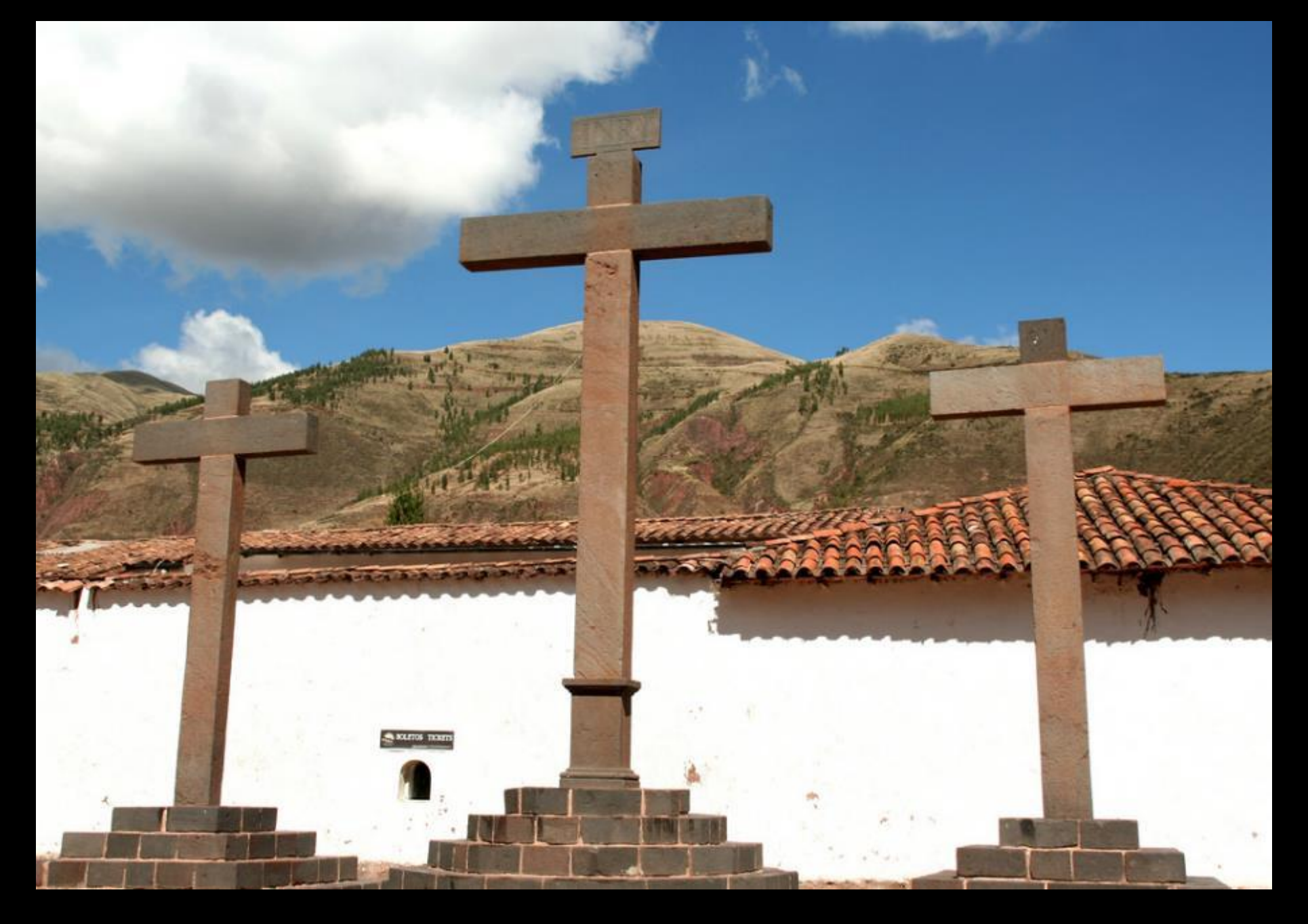
Church of St. Peter and St. Paul -- Andahuaylillas, Peru