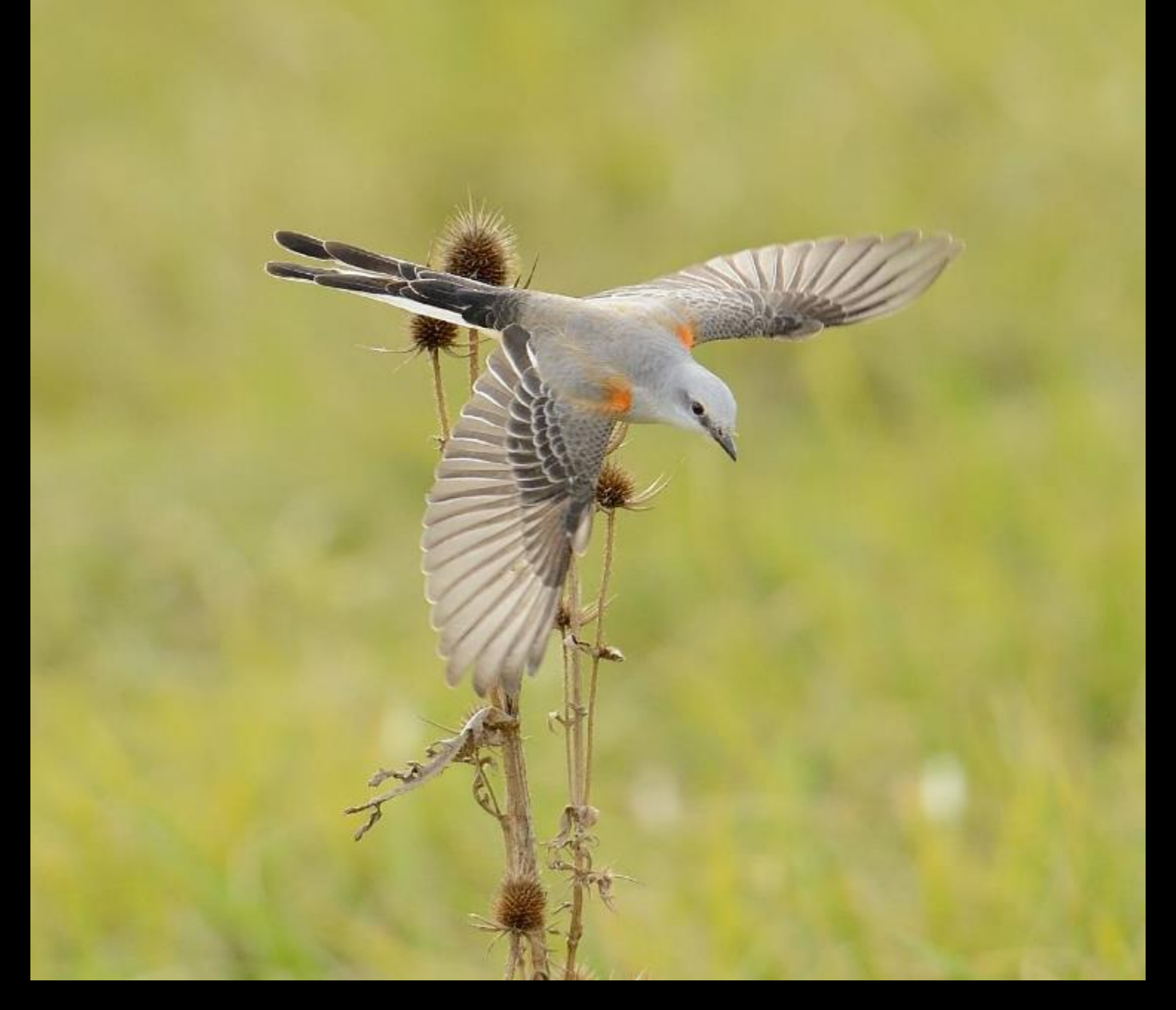
Scissor-tailed Flycatcher -- Former Landfill, Techny Overlay District, Northbrook, IL