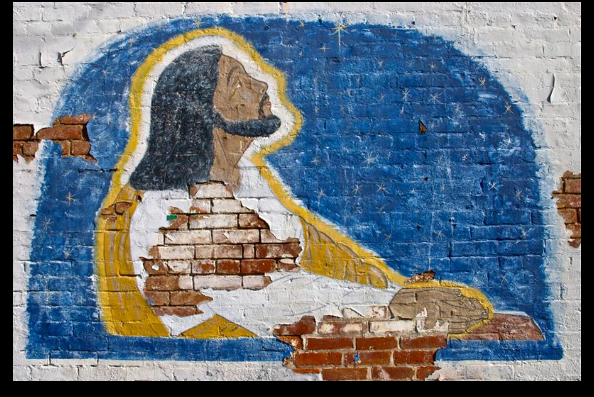
Jesus Praying -- Mural, Louisville, KY