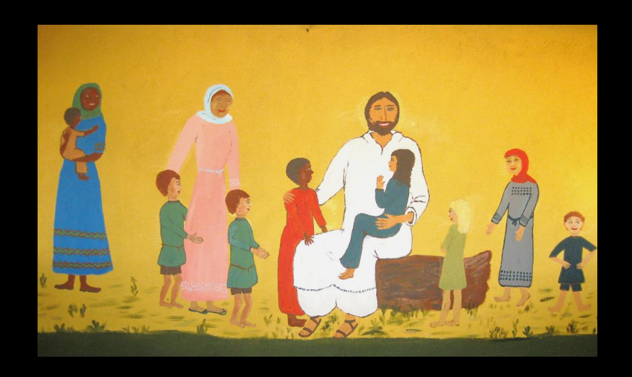
Jesus Welcomes All -- Church Mural, Sudan