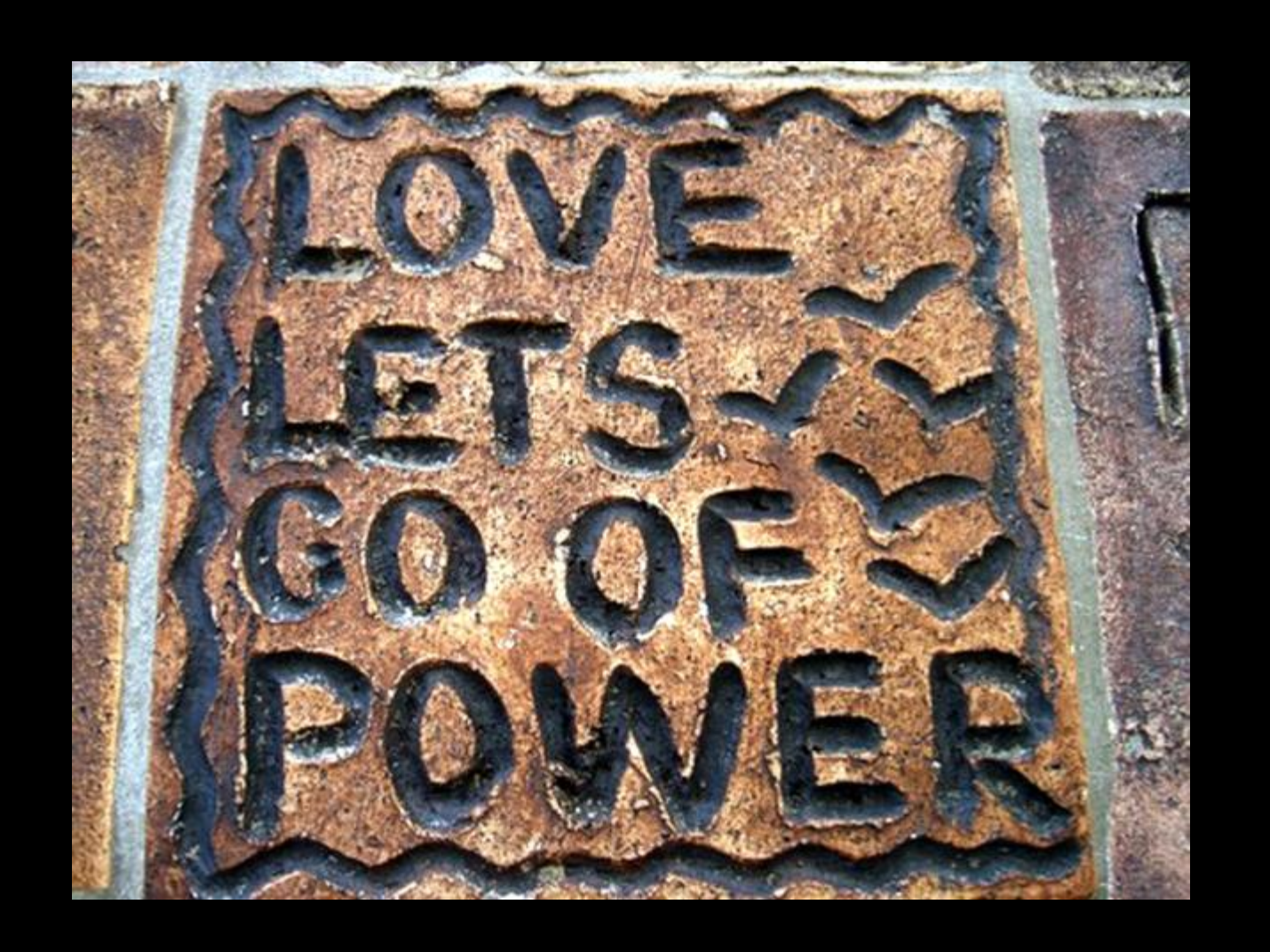
Tile from Peace Wall, Hamilton, New Zealand