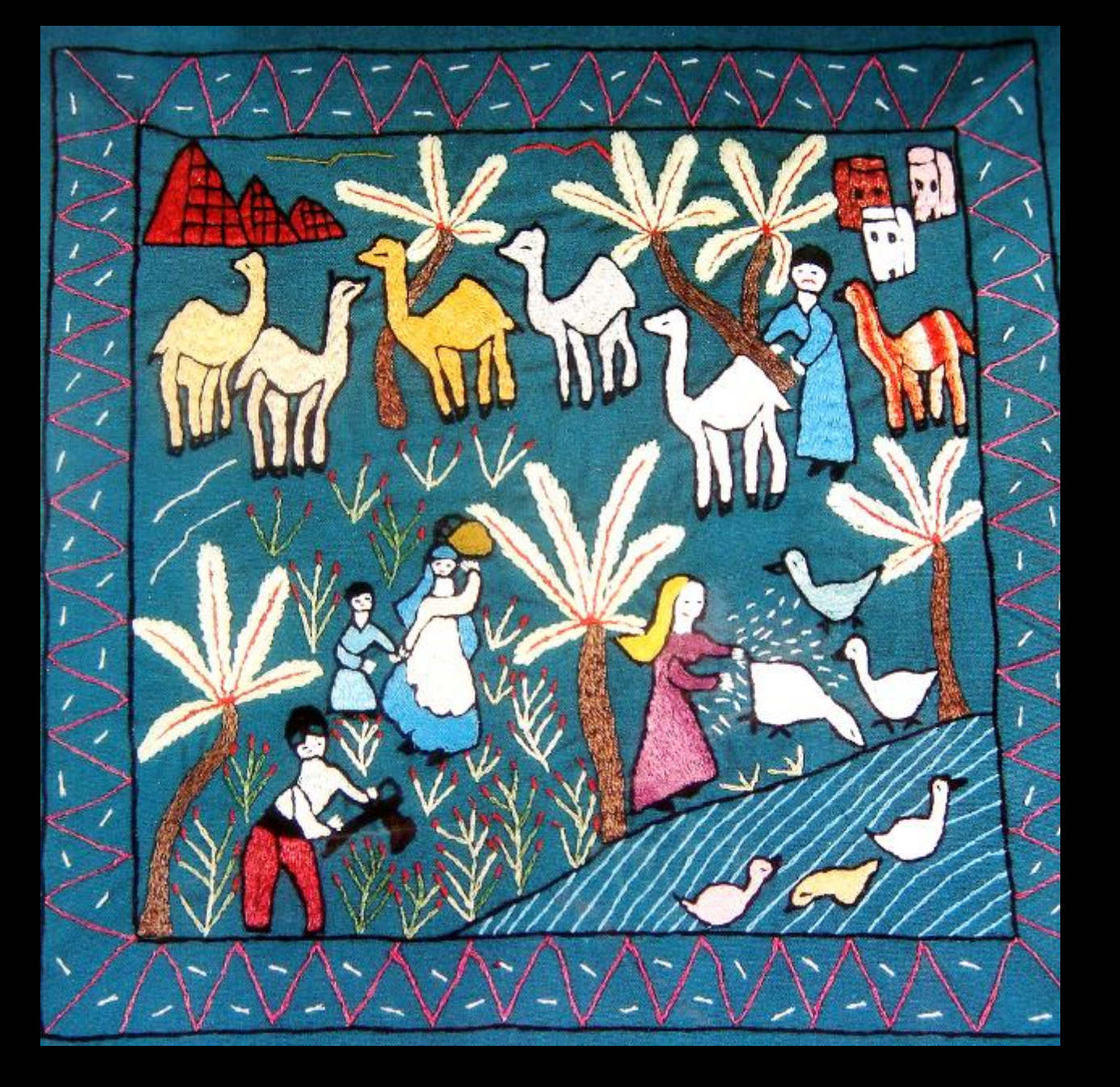
Daily Life -- Mottamadya Women's Association, Cairo, Egypt