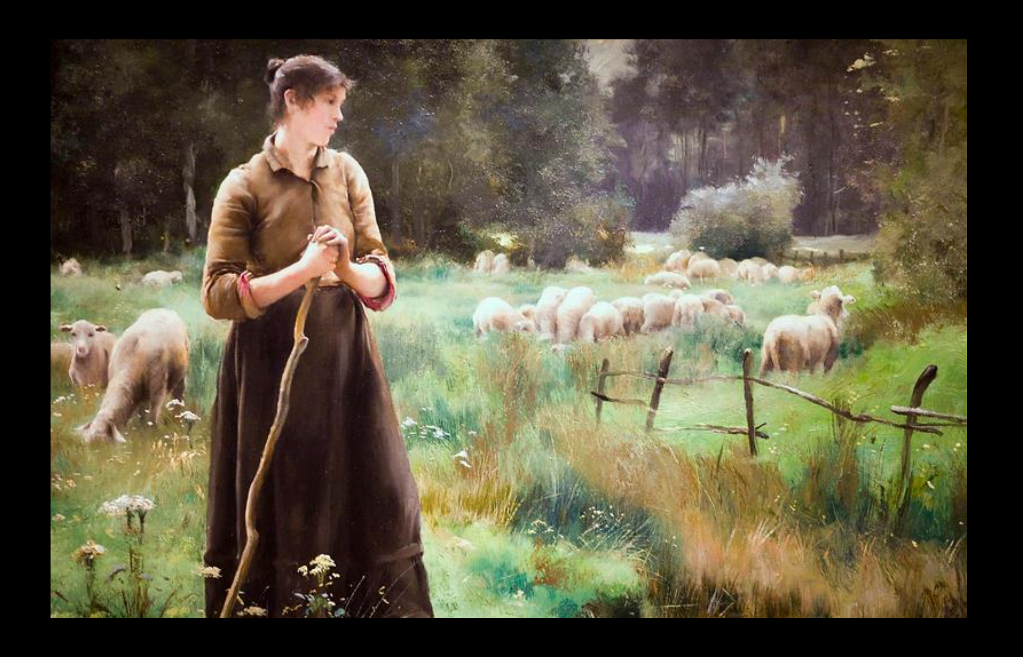
The Good Shepherd -- Julien Dupre, Legion of Honor Museum, San Francisco, CA